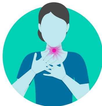
Langa Mamahi monga