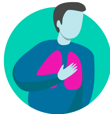
Nounou ho manava