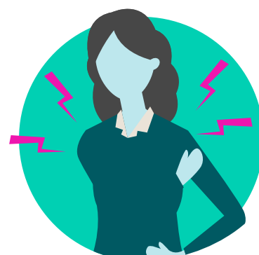
Langa pea mo mamahi uoua