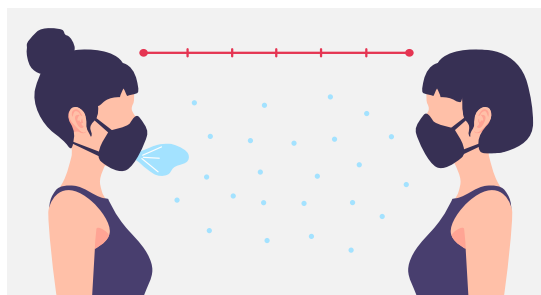
An ejelok kakolle in naninmej Eman an mour