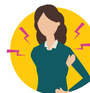
Metak majel ko

Kwōmaron loe kakōlkōl ko jet an COVID-19 ilo www.cdc.gov/coronavirus/2019-ncov/symptoms-testing/symptoms.html .