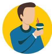
Diklok am at bwin ak neman jab dewōt