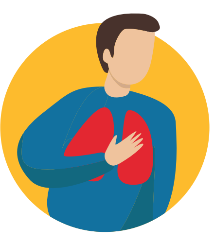
Shortness of Breath