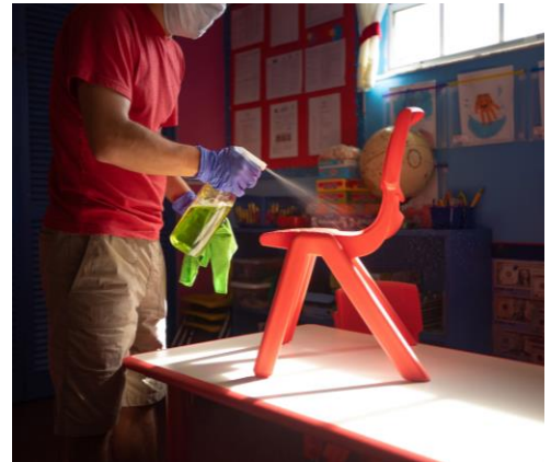
Nonwhite populations tend to work jobs that don’t translate to remote environments. Their hours also tend to be inflexible and often don’t offer sick leave, hazard pay, or health insurance.

Black and Hispanic Americans not only saw the steepest employment losses initially but are continuing to see a slower recovery than white Americans, further exacerbating inequalities and health disparities. 13